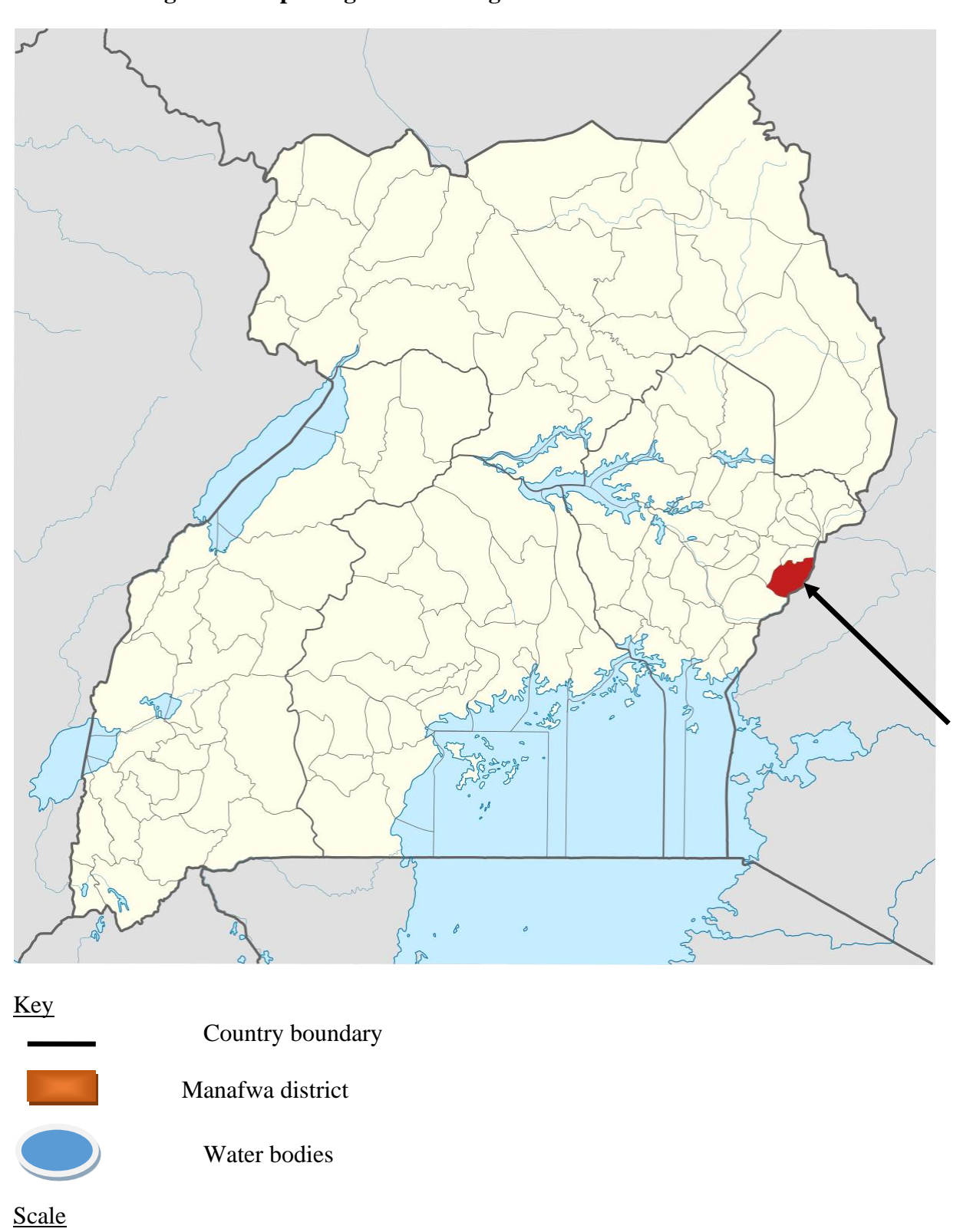
Figure 1: Map of Uganda showing location of Manafwa District